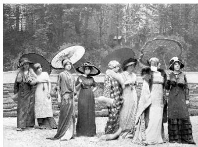
08 Paul Poiret’s mannequin parade in his garden in Paris, 1910