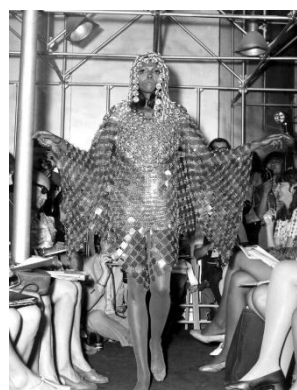
07 Paco Rabanne, Fashion Show 12 Unwearable Dresses in Contemporary Materials , Paris, 1966