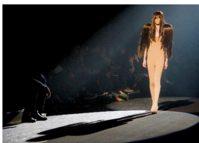
05 Maison Martin Margiela, Fashion Show, Spring-Summer 2009 Ready-to-Wear, Paris

Fashion shows are the magical moments in fashion industry – they are marketing machines and social events, deeply poetic and highly commercialized at the same time. Their images spread across the globe in real time, shaping our cultural memory. Following ever-changing concepts and narratives, they unite stage design, performance, clothing, light, and sound into a temporary Gesamtkunstwerk , a total work of art. The exhibition »Catwalk!« explores the fascinating evolution of the fashion show and offers a look behind the scenes: from its beginnings in couturiers’ salons around 1900 to the spectacular events of the twenty-first century; from haute couture to prêt-à-porter; from the era of supermodels to the celebration of diversity; from classic catwalk photography to the virtual fashion show. Through film and photo footage, original runway pieces, invitations, and stage props, the exhibition brings groundbreaking fashion shows back to life – including shows by Alexander McQueen, Balenciaga, Chanel, Comme des Garçons, Dior, Gucci, Helmut Lang, Hussein Chalayan, Martin Margiela, Prada, Yves Saint Laurent, and many more.