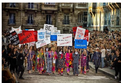
06 Chanel, Fashion Show, Spring-Summer 2015 Ready-to-Wear, Paris