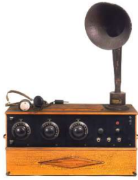
10 Radio, Canterbury, NH, c. 1922-1923 Shaker Museum, Chatham, New York