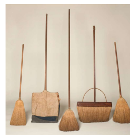
27 Brooms, Mount Lebanon, NY Shaker Museum, Chatham, New York