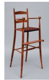
15 High chair, Mount Lebanon, NY, c. 1880- 83 Shaker Museum, Chatham, New York