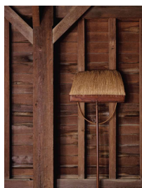
26 Polishing broom, New Lebanon, NY, 2024