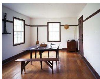
32 Shaker Village of Pleasant Hill, KY