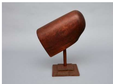
20 Bonnet form, North Family, Mount Lebanon, NY, 1860 Shaker Museum, Chatham, New York