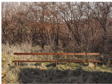
13 Meetinghouse bench, Canterbury or Enfield, NH, c. 1855