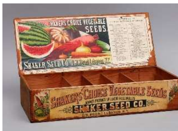
28 Seed box, Mount Lebanon, NY, c. 1880 Shaker Museum, Chatham, New York