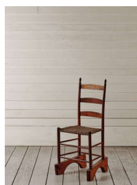
31 Modified side chair, Sabbathday Lake, ME, USA, c. 1875-99