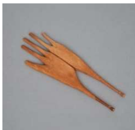
19 Glove form, Hancock, MA, 1880s Shaker Museum, Chatham, New York