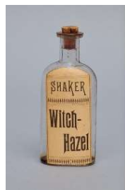
29 Medicine bottle „Witch-Hazel extract“, Canterbury, NH, 1920 Shaker Museum, Chatham, New York