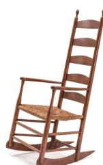
23 Rocking Chair, Mount Lebanon, NY, c. 1850-70