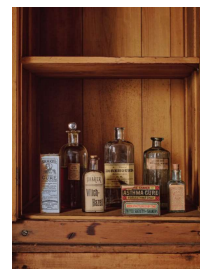
30 Various medicine bottles