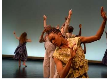
11 Fist and Heel Performance Group, »POWER«, 2024