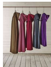
21 Wool cloaks