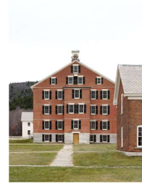
12 Dwellinghouse (1830), Hancock Shaker Village, Hancock, MA, 2024