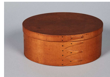
18 Oval box, Mount Lebanon, NY, 1860 Shaker Museum, Chatham, New York