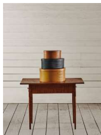
16 Oval boxes