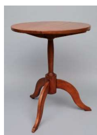
22 Side table, Mount Lebanon, NY, c. 1820- 50 Shaker Museum, Chatham, New York