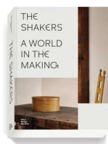
35 Publication to the exhibition »The Shakers: A World in the Making« © Vitra Design Museum, Graphic Design: Matt Kay, A Practice For Everyday Life based on photos by Alex Lesage

These images may be used only in connection with reporting about the exhibition and in conjunction with the image credits. High resolution pictures are available here: www.design-museum.de/press_images