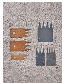
17 Woodworking patterns for oval boxes