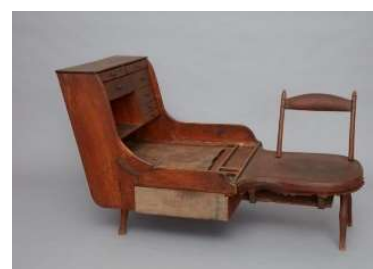
24 Cobbler's bench, Mount Lebanon, NY, approx. 1845 Shaker Museum, Chatham, New York