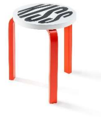
03 Barbara Kruger, Untitled (Kiss), Stool 60, 2019 (Design Alvar Aalto) © VG Bild-Kunst, Bonn 2021