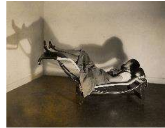
21 Charlotte Perriand on the Chaise longue basculante, 1929, Perriand and Jeanneret