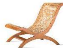
27 Clara Porset, Butaque, 1948