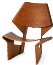
13 Grete Jalk, No. 9-1 / GJ Chair, 1963 © Vitra Design Museum, photo: Jürgen Hans