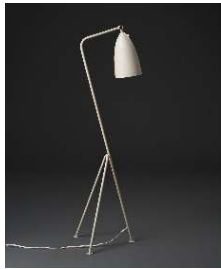
22 Greta Magnusson Grossman, Grasshopper, 1947 © Vitra Design Museum, photo: Andreas Jung