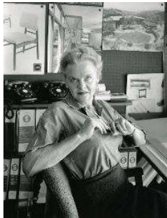
23 Greta Magnusson Grossman in her office at Claircrest Drive, 1959.