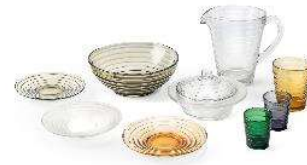
30 Aino Aalto, Bølgeblikk glas series, 1932

(The image must not be cropped, colored or layered with typography.)