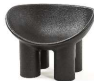
05 Faye Toogood, Roly Poly, 2018

(The image must not be cropped, colored or layered with typography.)