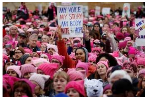
04 People gather for the Women's March in Washington D.C., 21 January 2017

(The image must not be cropped, colored or layered with typography.)