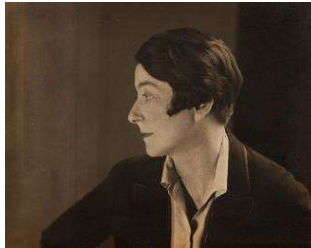
29 Berenice Abbott, portrait of Eileen Gray, 1927

(The image must not be cropped, colored or layered with typography.)