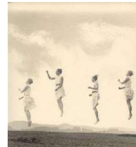
33 Loheland photo workshop: Jump (Montage), c. 1930