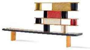
19 Charlotte Perriand, Untitled / Bibliothèque Tunisie, 1952