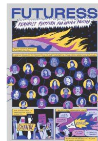
06 Illustration of the feminist Platform Futuress, 2021