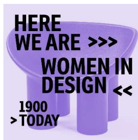
41 Key Visual for the exhibition »Here We Are!« © Vitra Design Museum, illustration: Judith Brugger, object: Faye Toogood, Roly Poly, 2018, photo: Andreas Sütterlin

All images containing a reference to VG Bild-Kunst Bonn can be used in Germany free of charge within three months prior to and six weeks after the duration of the exhibition. They may only be used in the context of editorial coverage on the exhibition (print, online, social media) and by naming the appropriate credit information. Usage of these images in other countries may be subject to authorization and fees, and must be cleared in advance. For regulations on image usage in other countries, please refer to the appropriate collecting society: https://www.bildkunst.de/en/vg-bild-kunst/sister-societies