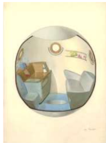
25 Galina Balashova, Sketch of the interior of the orbital (living) compartment of the Soyuz spacecraft. Variant 1, 1963, © The Museum of Cosmonautics, Moscow