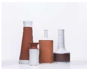
16 Hedwig Bollhagen, Vases. Individual and sample pieces, 1950s and 1960s