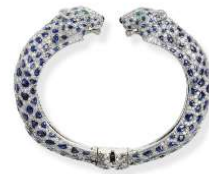
15 Panthère bracelet, Cartier Paris, 1958, Cartier Collection, © Cartier