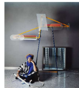
09 Nanda Vigo 1985 with her designs Light Tree (1984) and Cronotopo (1964).