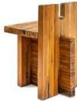
11 Lina Bo Bardi, Stool for Centre SESC Pompeia, São Paulo, 1979/80 © VG Bild-Kunst, Bonn 2021