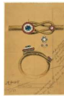
18 Design for a bracelet, Cartier Paris, 1950, Archives Cartier Paris © Cartier