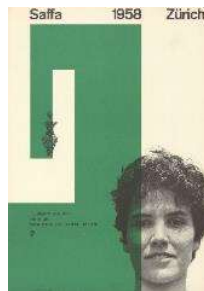
14 Poster for the Schweizerische Ausstellung für Frauenarbeit (Swiss Exhibition for Women's Work), SAFFA, Zurich, 1958, design by Nelly Rudin Plakatsammlung Schule für Gestaltung Basel, Copyright for Nelly Rudin: © VG Bild-Kunst, Bonn 2021