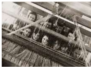
32 Life at the Bauhaus: Group portrait of the weavers behind their loom in the weaving workshop, Bauhaus Dessau, 1928.

(The image must not be cropped, colored or layered with typography.)