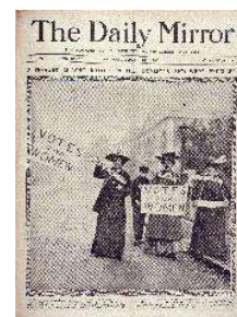
36 Newspaper article on suffragettes who protested in the House of Commons, in: The Daily Mirror , London, April 27, 1906