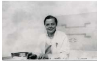
20 Charlotte Perriand, ca. 1929