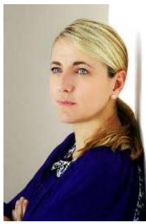
38 Patricia Urquiola