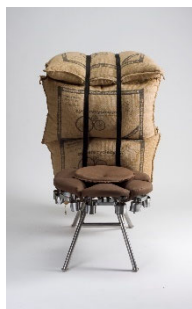
10 Gunjan Gupta, Old Bori Throne, 2008 © wrap Art & Design Pvt Lt