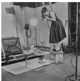
01 Ray Eames photographing the »Tandem Seating« at the Eames Studio, 23 October 1962, Eames Collection Vitra Design Museum © Eames Office LLC