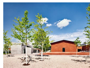
18 Exterior view Vitra Schaudapot