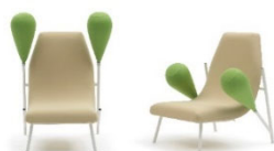
02 Matali Crasset, Extension de générosité, 2017, photo: Ezio Prandini © VG Bild-Kunst, Bonn 2021