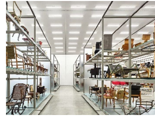
21 Interior view Vitra Schaudepot

These images may be used only in connection with reporting about the exhibition and in conjunction with the image credits. High resolution pictures are available here: www.design-museum.de/press_images