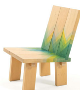
04 Raw-Edges, Herringbones Chair, 2016