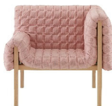
17 Inga Sempé, Ruché, 2010 © Ligne Roset