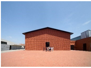
19 Exterior view Vitra Schaudepot