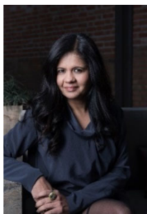
11 Gunjan Gupta © wrap Art & Design Pvt Ltd