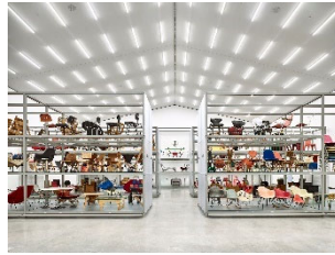
20 Interior view Vitra Schaudepot