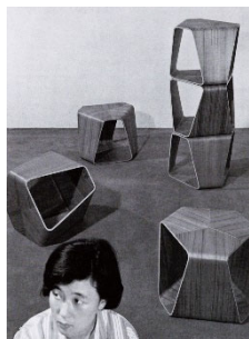
07 Reiko Tanabe in the magazine »Geijjutsu Shincho«, August 1967