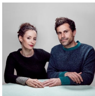
05 Raw-Edges, 2019