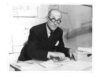
24 Le Corbusier, 1947 © FLC

These images may be used only in connection with reporting about the exhibition and in conjunction with the image credits. High resolution pictures are available here: www.design-museum.de/press_images