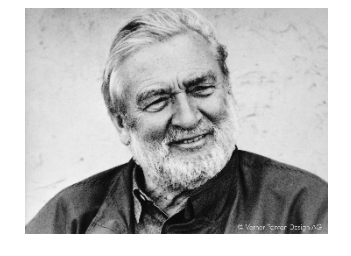
23 Verner Panton, 1993 © Verner Panton Design AG