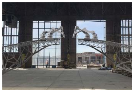
04 Joris Laarman for MX3D »Bridge Project«, 2015, 3D-printed pedestrian bridge