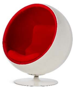
01 Eero Aarnio, Pallo / Ball Chair, 1963

26 March – 4 September 2022, Vitra Design Museum