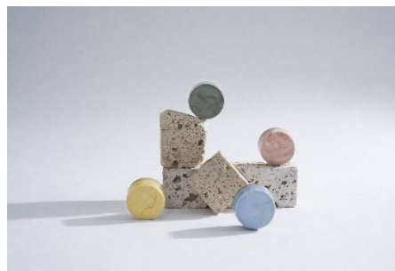
02 Shellworks, jars made from Vivomer, 2021