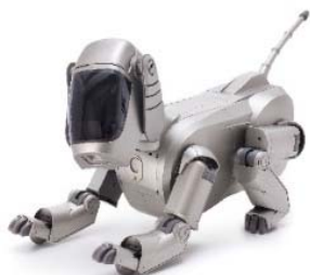
03 Hajime Sorayama, Sony Corporation »AIBO Entertainment Robot (ERS-110)« 1999 private collection, Photo: Andreas Sütterlin

24 September 2022 – 5 March 2023, Vitra Design Museum