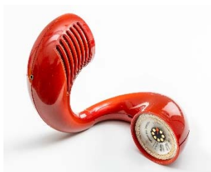
16 Panasonic Toot-a-Loop R-72S radio, 1969-72