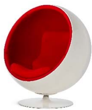
10 Eero Aarnio, Pallo / Ball Chair, Globe Chair, 1963