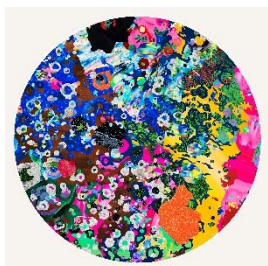
01 Key visual for the exhibition »Plastic: Remaking Our World« illustration: Daniel Streat, Visual Fields