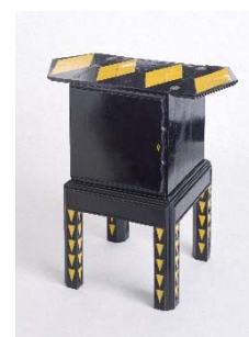
06 Smoker's Cabinet, 1916, Charles Rennie Mackintosh