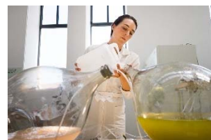
21 Klarenbeek & Dros in collaboration with Luma, cultivation of micro algae for biopolymers; photo: Antoine Raab, courtesy of Luma