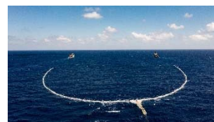
15 The Ocean Cleanup, system 002 deployed for testing in the Great Pacific Garbage Patch, 2021