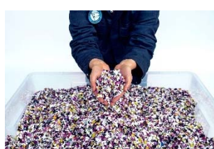
26 Precious Plastic, shredded plastic