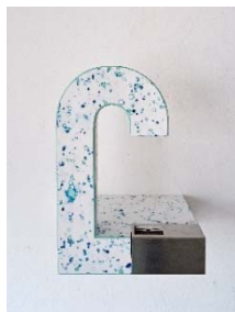
11 Dixon drinking fountain, Mirrl of Glasgow; Courtesy of Mirrl of Glasgow & Design Exhibition Scotland, photo: Andy Stagg