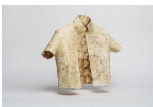
25 MycTeX in collaboration with Karin Vlug, MycoTEX seamless jacket