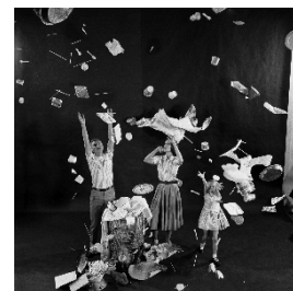
03 staged to illustrate an article on »Throwaway Living«, LIFE magazine, August 1, 1955