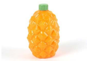
07 Edward Hack, Pineapple syrup bottle, c. 1958