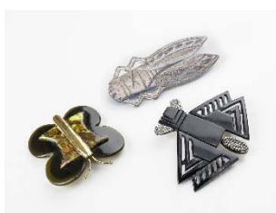
04 Maison Auguste Bonaz, brooches made from galalith and silver plated lucite, c. 1920-30