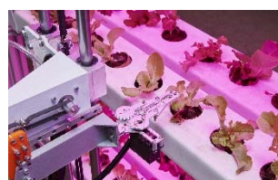
19 Marco Cagnoni, Plastic Culture / Vertical Bioplastic Farm, 2018; Photo: Nicole Marnati