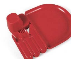
09 Jean Pierre Vitrac, »Plack« picnic ware, c. 1977