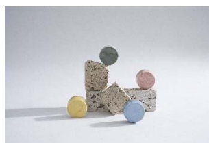
17 Shellworks, jars made from Vivomer, a bioplastic produced with the help of microbes, 2021 © Shellworks, Photo: Catharina Pavitschitz