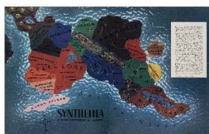
08 Map of Synthetica, a continent of plastics, published in »Fortune« Magazine, 22 October 1940; Vitra Design Museum archive