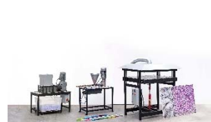
27 Precious Plastic machines version 4 including a shredder, extruder and sheet press; Courtesy of Precious Plastic

These images may be used only in connection with reporting about the exhibition and in conjunction with the image credits. High resolution pictures are available here: www.design-museum.de/press_images