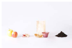
23 Biodegradable packaging made from apple cellulose, Innocell Project, Free University Bozen – Bolzano