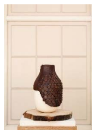
20 Studio Formafantasma, Botanica, commissioned by Plart Foundation, 2011