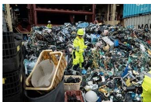
13 The Ocean Cleanup, crew sorting plastic on deck after System 002 extraction, October 2021